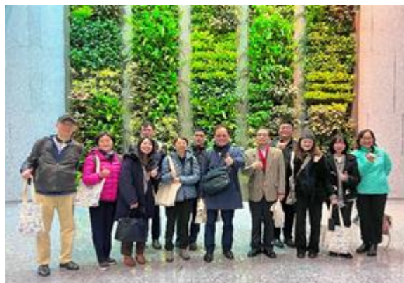
A group photo for CIECA's colleagues to visit Advantech AIoT Co-Creation Campus III.